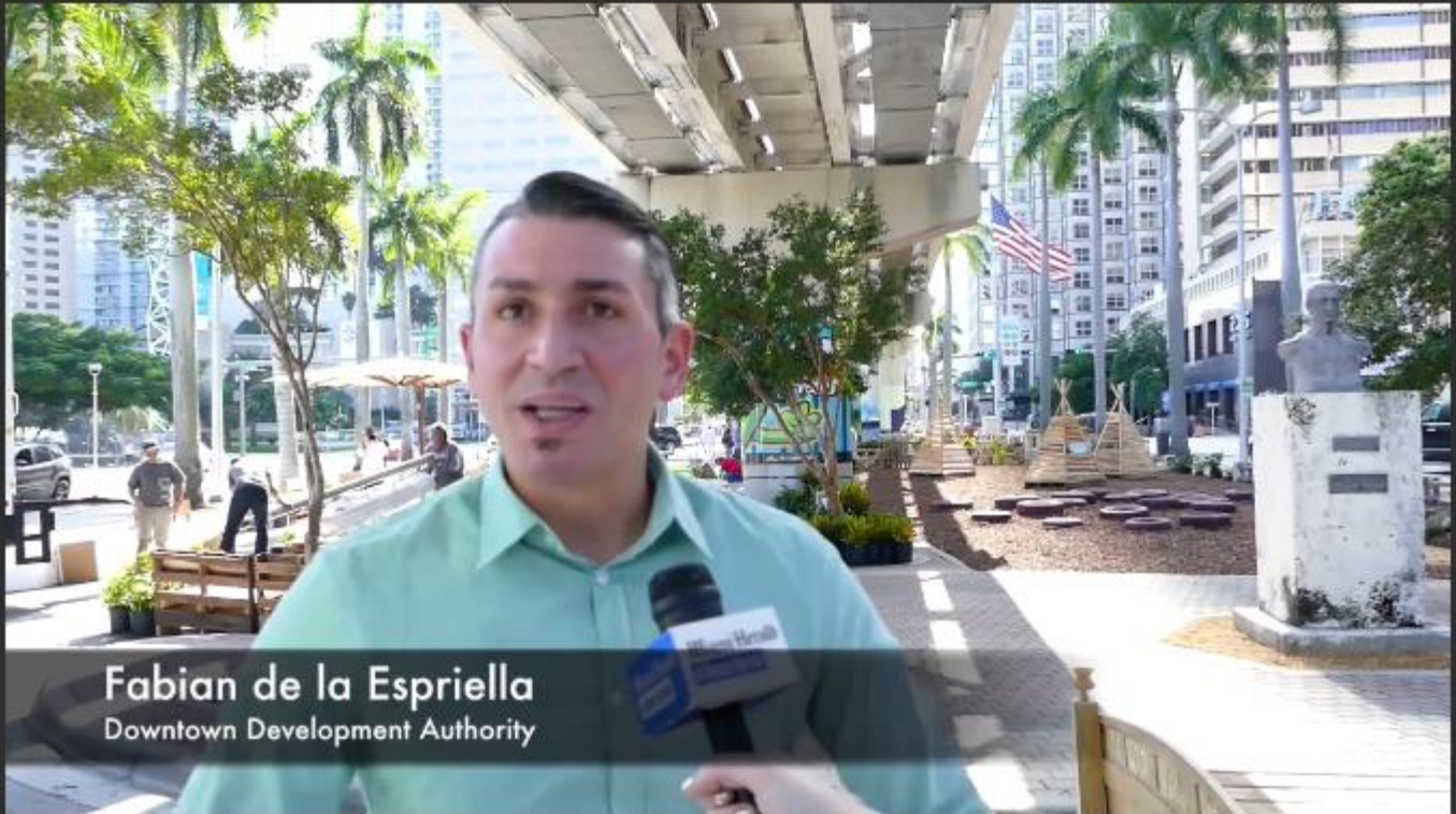
Fabian de la Espriella Downtown Development Authority